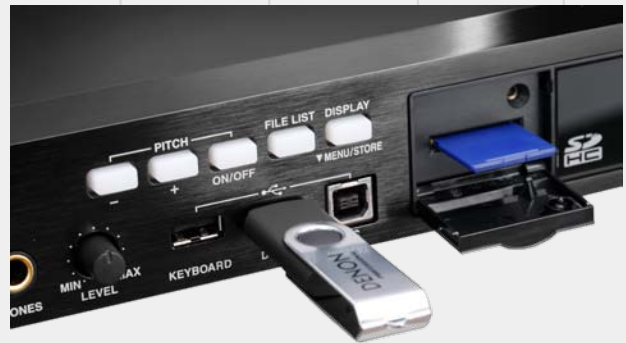
*RC-F400S compatibility available 10/2010

Stereo and mono audio channels are simultaneously available and both WAV and MP3 file formats are supported, with selectable sample rates of 96, 48 and 44.1 kHz, 24 and 16 bit resolution, and MP3 bit rates between 32 and 320 kbps. Cascade recording and file management capabilities between the SD / SDHC card and connected USB drive, and USB connectivity to PC enables file transfer.